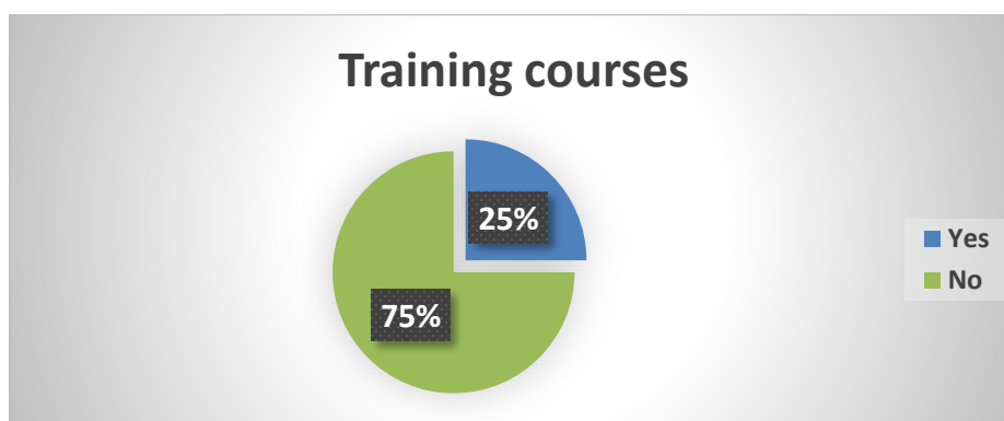
Figure (1): Percentage distribution of studied nurses regarding their attending training courses about high alert medication (n= 80).