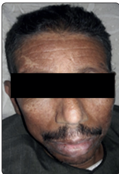
Fig. (4) Skin hyperpigmentation.