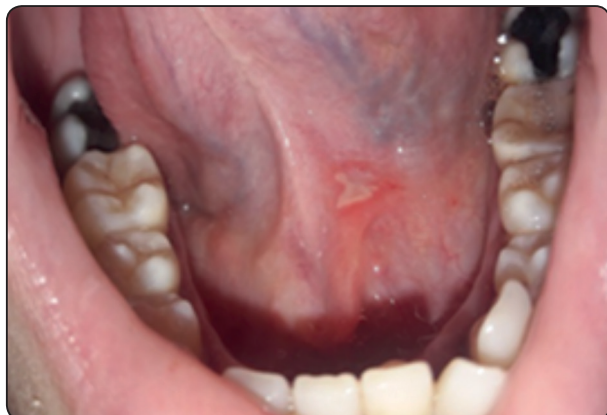
Fig. (3) RAU at the floor of the mouth.