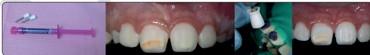
Fig. (1) Method of Opalustre application.

Statistical analysis was carried out using SPSS 16 ® (Statistical Package for Scientific Studies),